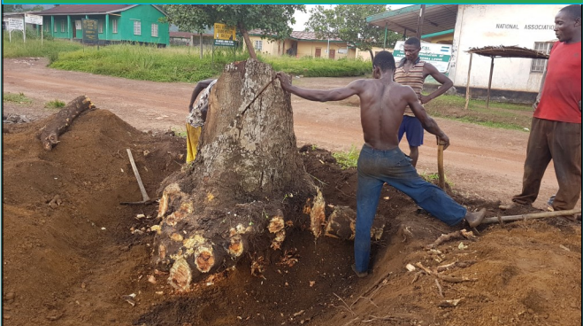
Manual labour being used to uproot trees