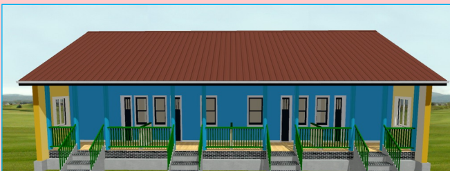
Teachers' lodge for Matakan Community Primary School

This project is funded by the North-South-Bridge foundation, Fambul Tik and YAD. It includes a five-room apartment block, toilets, kitchen, store and solar light. The main goal is to provide a conducive accommodation facility for trained and qualified teachers who have been assigned to the school by the central government. YAD believes that the lack of conducive housing for teachers is another challenge that might jeopardize President Bio's free education agenda.