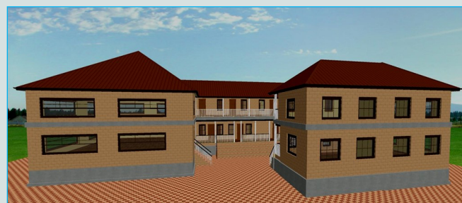
Youth Resource Academy (YRA)

This phase entails mainly skill training facilities. The objective is to facilitate access of underprivileged youth to high quality skills, which could enable them become self-reliant and economically independent. It includes dressmaking, cosmetology, catering, secretariat and office management, screen-printing and sport. The sport component provides many modern sport apparatus such as gymnastic gadgets, billiard, table tennis, table football etc. This phase, when successfully completed, shall be called Youth Resource Academy (YRA) and it shall turn the MYRC into the safest youth kingdom in Sierra Leone. This project is currently ongoing with the hope of completing it by December 2019.