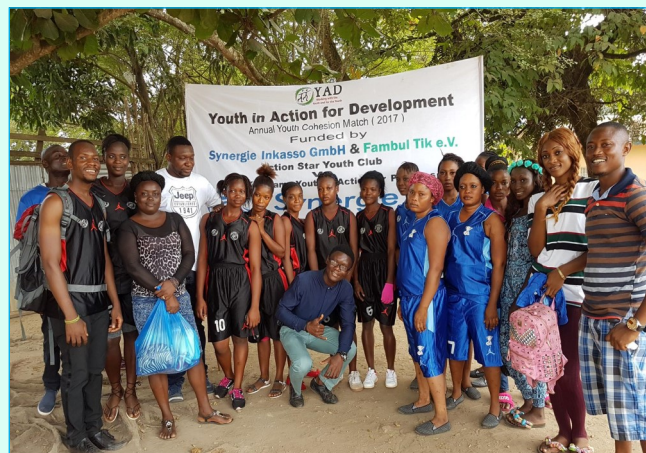
Annual Youth Cohesion Match 2017, volley ball teams

In collaboration with Synergie Inkasso GmbH, a debt collection company based in Berlin – Germany, YAD organized the match at the police training field in central Kenema and it attracted participants from all over the city. Gbo-kakajama boys won the Football match while Action Star girls won the volleyball match. The cups and prizes were presented at the youth unification party which took place at YAD office on the same day.