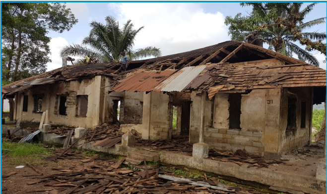
The land was partly occupied by a dilapidated government quarter, J1

and temporal lodging. The entire facility is powered by a 23KW solar system that makes it completely energy independent.