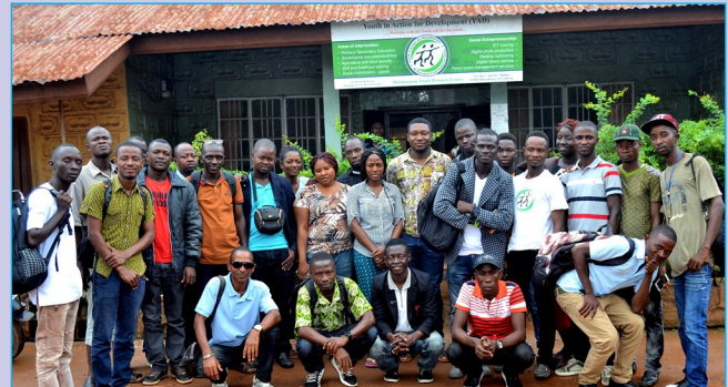
A cross-section of photographers and YAD staff

same start-capital is used to purchase more cameras for the benefit of more youth in future. While we print for them at cost recovery, we urge them to pursue future carriers in other fields. This is another innovative way of helping the underprivileged youth to help themselves in our community. It's more honourable and safer than Okada riding and it enables those who are determined to study further to pay their own fees without bothering parents and extended families.