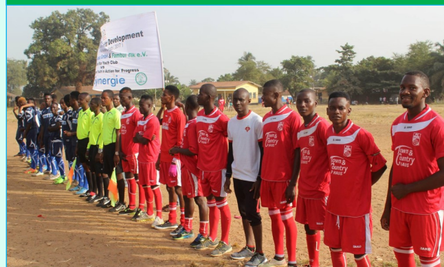
Annual Youth Cohesion Match 2017, football teams