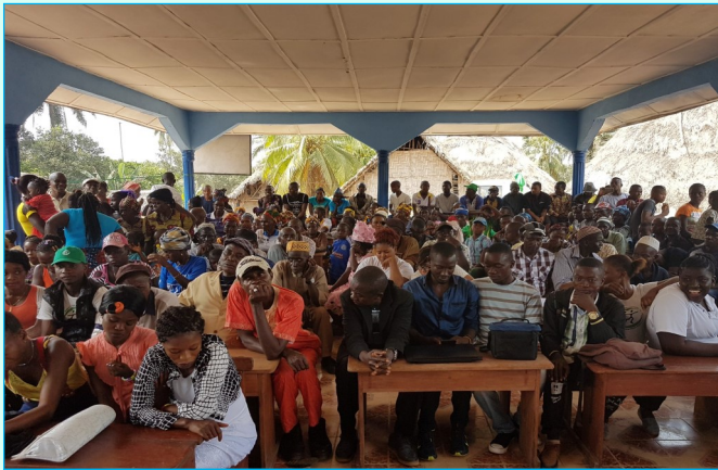
Community Mobilization and Conflict Resolution Centre for Matakan