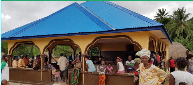
Community Mobilization and Conflict Resolution Centre for Golahun Vaama