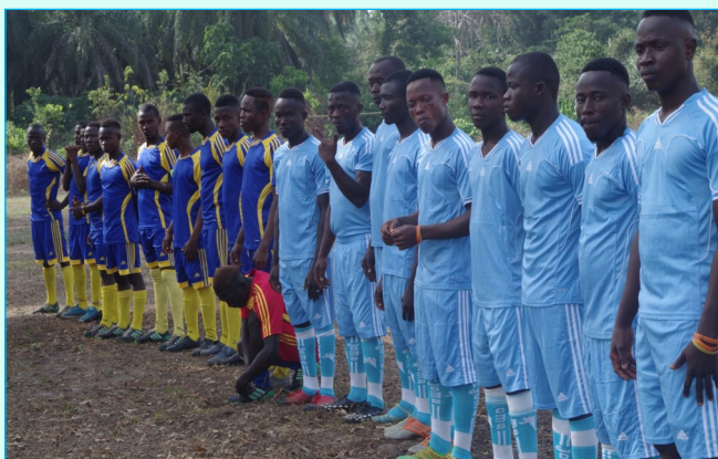
Teyema and Mabondor community ready to lock horns

Situated along the Pujehun Blama highway, Mabondor and Teyema sections are two of the five sections that make up Niawa chiefdom. Geographically, the Niawa chiefdom itself is strategically situated but constantly neglected due to its economic situation. The chiefdom is situated under the forested hill that divides south and eastern provinces, Pujehun and Kenema districts, but it is not a home for precious minerals and cash crops. This makes life very miserable for the youth, women and children in this part of the country. While YAD mobilizes them to engage in other community development projects, it is also using community unification sports as a magnet to unify them to resist poverty.