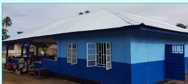
Community Mobilization and Conflict Resolution Centre for Matakan

Co-financed by the Nord-South Bridge Foundation, Fambul Tik and YAD, the project provided modern community mobilization centres for the residents of Matakan and Golahun Vaama towns, in Niawa Chiefdom. Included in the centres are offices, stores, toilets and solar light. YAD adopted this model after it realized that the lack of mobilization centres makes it difficult for many communities to meet and discuss developmental issues. This problem affected the people in the rainy season as well as the dry season as they scouted about searching for appropriate meeting grounds. The solar light included in the project makes electricity reachable for the rural dwellers that lived in constant darkness. It also makes it easier for them to use mobile phones, as the centres have now become a source of electricity for phone users.