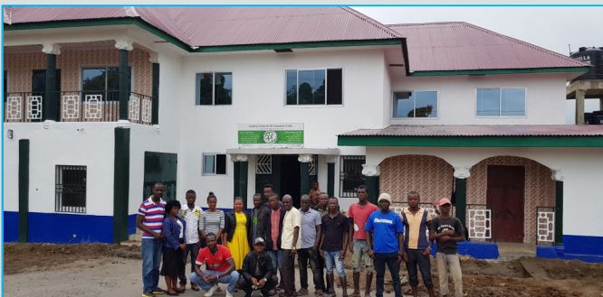
Front view of MYRC building