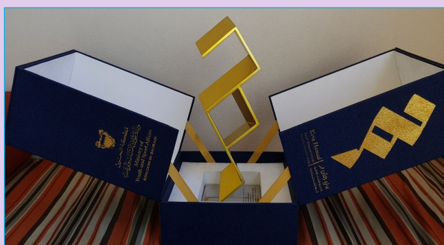
The King Hamad Youth Empowerment trophy

WE WOULD LIKE TO EXTEND TO YOU AN INVITATION TO ATTEND THE AWARD CEREMONY IN BAHRAIN. CONGRATULATIONS ON BEING THE RECIPIENT OF THIS PRESTIGIOUS AWARD AND WE ARE LOOKING FORWARD TO MEETING YOU AT THE AWARD CEREMONY IN BAHRAIN."