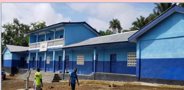
Niawa Chiefdom Secondary School

Co-funded by overseas main partners like Fambul Tik and the German Federal Ministry of Economic Cooperation, the project entails six standard classrooms, the principal's office, staffroom, library, toilet and solar light. The school is situated at Gandorhun town, Niawa Chiefdom, Kenema district. The objective of this project is to make free quality education available for children of Niawa chiefdom and its surroundings. The school is current accommodating children from Niawa, Langorama and Barri chiefdoms respectively.