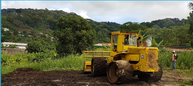
The rest of the land was a mere bush; a caterpillar was needed to clear it