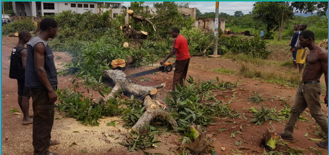
Power saws being used to cut down trees