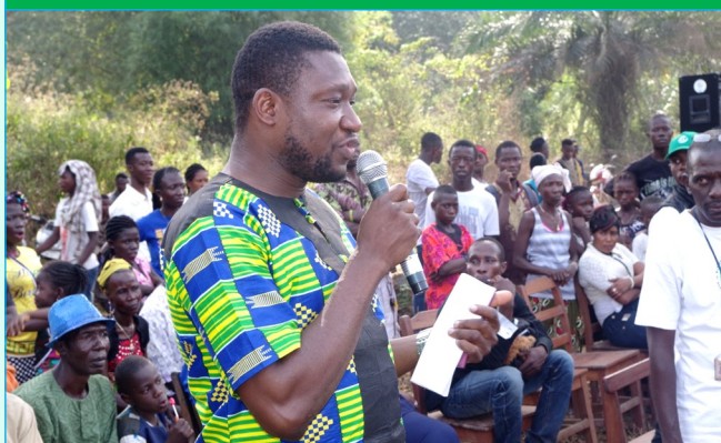
Teyema and Mabondor Community being sensitized on peace