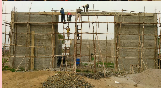
The structure has already reached a wall height