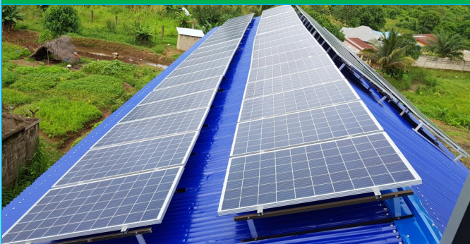
The building has 72 solar panels, largest private grid in Kenema