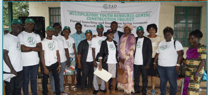
A cross-section of YAD staff and the Deputy Mayor of Kenema Municipality, Esther Guanya Kaisama shortly after the launching