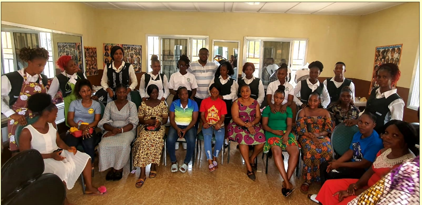
Corss-section of students in beauty therapy and cosmetology class—2021/2022 academic year