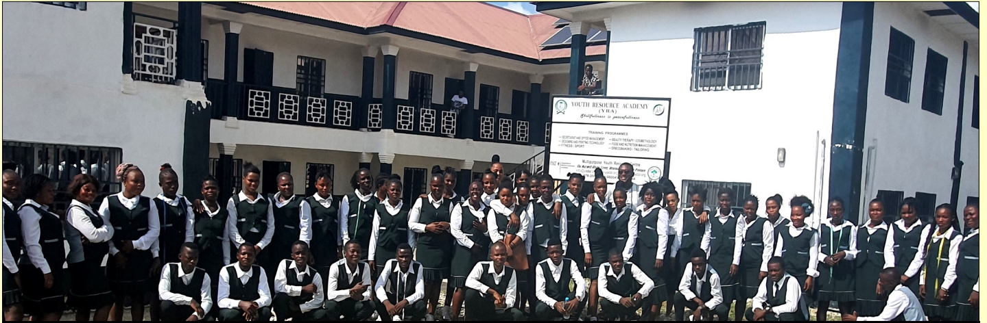
Cross-section of YRA students — 2021/2022 academic year

YRA's overarching goal is to eradicate poverty and unemployment for underprivileged youths in the eastern region through cost-free access to essential skills that shall enable them to become self-reliant and economically independent. The specific objectives are 1) to complement the government's efforts in the area of TVET by providing a conducive environment for skills training and wealth creation for underprivileged youths in accordance with Sierra Leone's Medium Term National Development Plan 2019-2023 and the government's free quality education flagship programme ; 2) to facilitate the transfer of knowledge and skills from European volunteers through the Sierra Leone/German cooperation to enable the students to acquire cutting edged skills; 3) to foster linkages between graduates from various programmes and potential employers across the country through internships, advocacy and skill-marketing; 4) to support graduates to establish private artisanal workshops and business enterprises through YAD's social entrepreneurship and microloan programmes.