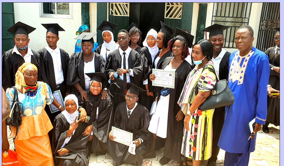
A cross-section of graduates and stakeholders after graduation ceremony

The institute is fully recognized by the government of Sierra Leone's Ministry of Higher and Technical Education as a vocational and technical training institute that contributes to youth industrialization and middle-level human resources development in post-conflict Sierra Leone.