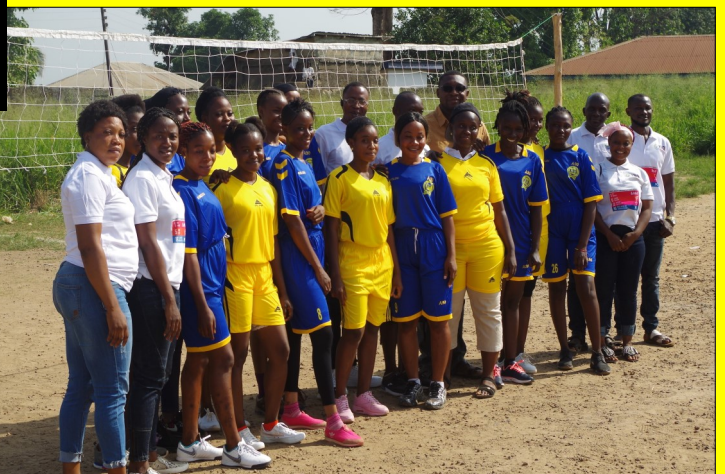
A pictorial review of 2021 Youth Cohesion Day in Kenema