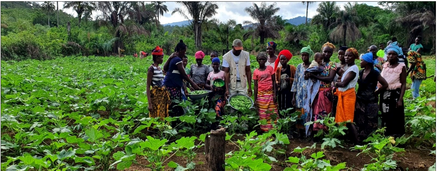
NIHP women harvesting okra at Matakan village in happy dispensation

As the name rightly implies, the main goal of NIHP is to improve the socio-economic and nutritional situation of 300 youth and female-headed households with approximately 2500 dependants in 7 villages across Niawa chiefdoms within 30 months. Key objectives include 1) cultivation of 50 acres of IVS and 50 acres of boliland for the production of rice, cassava and assorted vegetables, the main staple foods for the average Sierra Leonean household. 2) establish a food storage, processing and marketing centre equipt with rice mills and cassava processors to enable beneficiaries to add value to their products before marketing. 3) transform the beneficiary groups into a Community Based Organization (CBO) and capacitate them in climate adaptation and safe nutritional practices – especially for children.