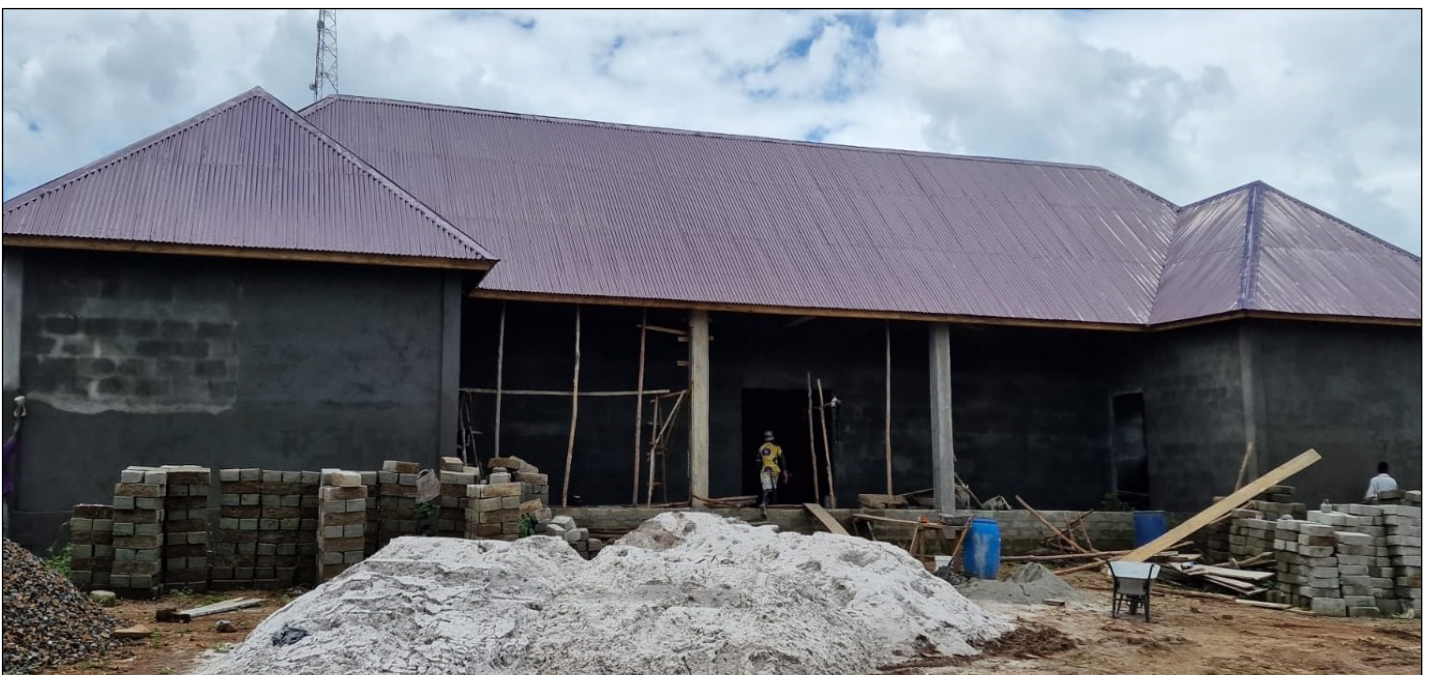
A crop processing, storage and marketing center being constructed at Jekoyeiya, near Sendumei town in the central heart of Niawa chiefdom. All gadgets required to get the center functional have been imported from competent factories abroad

NIHP has established branches in all the targeted villages with solid executives representing their interests everywhere. The various groups have created a global executive that represents them collectively. Each group has also established a bank account at the community bank in Sendumei town where their project revenue is saved. Each branch has embarked on the cultivation of rice, cassava and assorted vegetables.