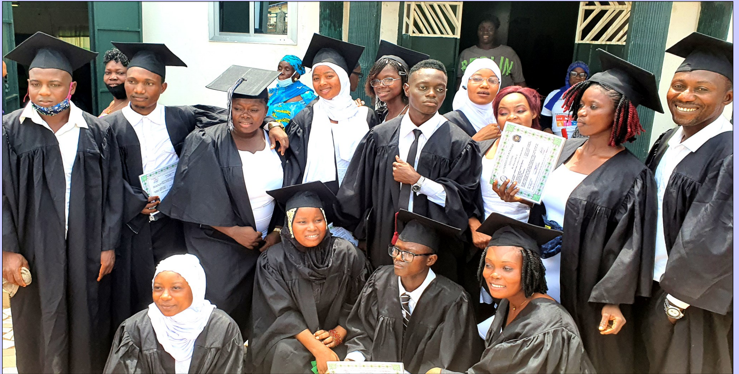
A cross-section of happy graduates (2020/2021 batch)