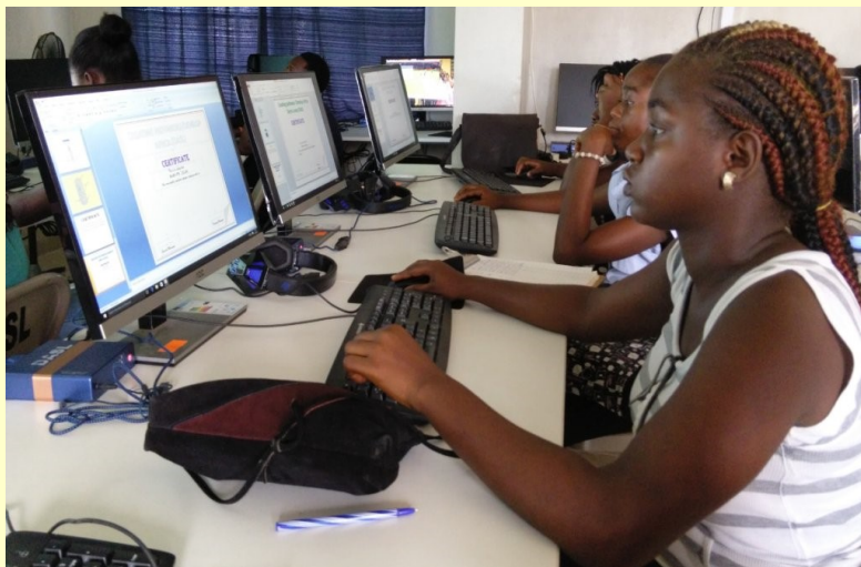
Students in the ICT/Secretarial class—2021/2022 academic year

Our secretarial and office management faculty is combined with Information and Communication Technology (ICT). This component targets youth with some degree of primary and secondary education. The objective is to equip them with the necessary skills and qualifications to serve as secretaries or clerks in government offices, NGOs or other public institutions. YRA considers the successful enrolment in this faculty as automatic enrolment in the ICT training because a secretary in today's office environment must have computer knowledge. Meanwhile, enrolment in the ICT training (alone) does not guarantee direct enrolment in the secretarial and office management faculty since the former is more robust than the latter and the training lasts longer. However, enrolling in either programme can help candidates develop confidence in themselves to undertake further tertiary studies while working in a business environment. An exceptional opportunity that the candidates stand to gain is the high-quality ICT training manual which is tailor-made to be taught only at YRA. The ICT and secretarial/office management training has recorded more than 200 students since the inception of YRA in the year 2021.