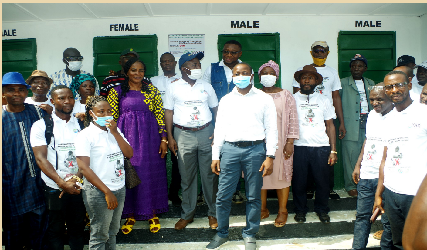
A cross-section of YAD staff after the formal inauguration of toilets at Sendumei town, Niawa chiefdom

Another beneficiary at Yabaima village explained his ordeal of how his entire family had to defecate in the same bucket at night and empty it every morning in the nearby river due to the lack of a toilet. "We can now inhale healthy air at night, now that there is a toilet next to the house", he said. "May Allah bless YAD!" he prayed.