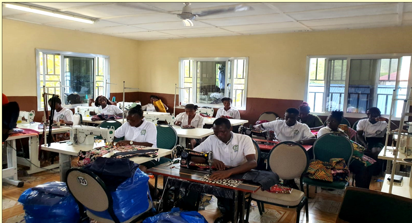
Cross-section of students in the dressmaking/tailoring class—2021/2022 academic year

Our tailoring/dressmaking faculty is one of the most attractive faculties of YRA. Our tutors are highly educated and experienced in the tailoring and designing vocation. Some students in the department have already started earning from what they have learnt. Some have begun sewing for family members and friends, and others are getting tips directly from their tutors for special contracts. One of the significant patronizers of YRA who have placed confidence and trust in the institution by giving them official jobs is the Doctors without Borders (MSF) - Kenema office. During the past 12 months, YRA has gained millions of Leones' contracts from MSF for designing and sewing aprons, scrubs and face - masks, which not only supports the intuition but also gives the students confidence and trust in the designing and sewing profession as a reliable trade for their future.