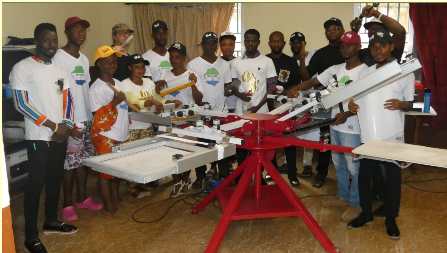
Cross-section of executive training participants from YAD/YRA