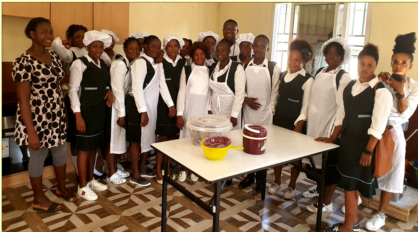
Cross-section of students in the Hospitality/catering class—2021/2022 academic year