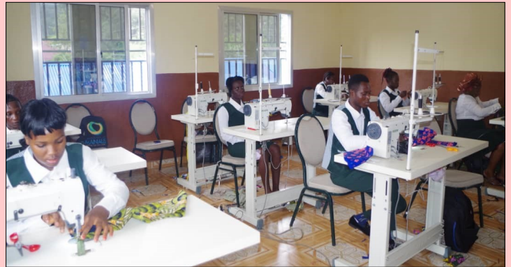
Our tailoring classroom is equipped with electrical powered industrial sewing machines

This faculty is well equipped with modern industrial sewing machines. The practical and theoretical lectures are conducted in separate classrooms. Training lasts between 18 to 24 months after which the candidates shall sit to National Council for Technical Vocational and other Academic Awards (NCTVA) exams for the award of diploma certificate in textile designing and dressmaking. With donor supports, YAD intends to support all graduates from this faculty with start-up kits, mainly sewing machines, to enable them establish their own sewing enterprises and become self-reliant.