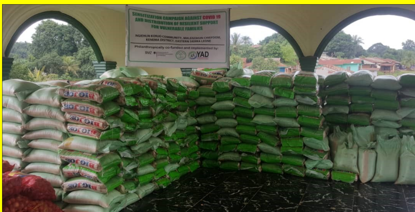
Emergency COVID-19 response support food and non-food items being distributed by YAD to vulnerable households in Konjo Buima, Malegohun Chiefdom, Kenema district

When the government of Sierra Leone declared a nationwide struggle against COVID-19 by imposing drastic precautions including lockdowns, road blocks, down to dusk curfews etc., residents of the rural areas became more vulnerable than ever before, especially when it all occurred at the pick of the raining season when many pots stopped boiling and pockets were virtually empty. That was the time YAD launched its all-out sensitization campaign against COVID-19 in its targeted communities. Titled “Sensitization Campaign against COVID-19 and Distribution of Resilient Support to Vulnerable Households, the project was funded by BMZ and Fambul Tik focusing mainly on distribution of basic hygiene and sanitary materials, masks and food items. More than 900 bags of rice, 4500 lumps of soap, 5985 cubes of jumbo maggi, 84 bags onions, 175 bags salt, 375 canisters of oil, 6450 masks, 10 giant wash hand stations and hand sanitizers were distributed to about 500 households with more than 8500 dependants in various communities across Kenema district with special focus on Kenema city, Konjo Buima community in Malegohun chiefdom and Mabondor in Niawa Chiefdom, Kenema district.