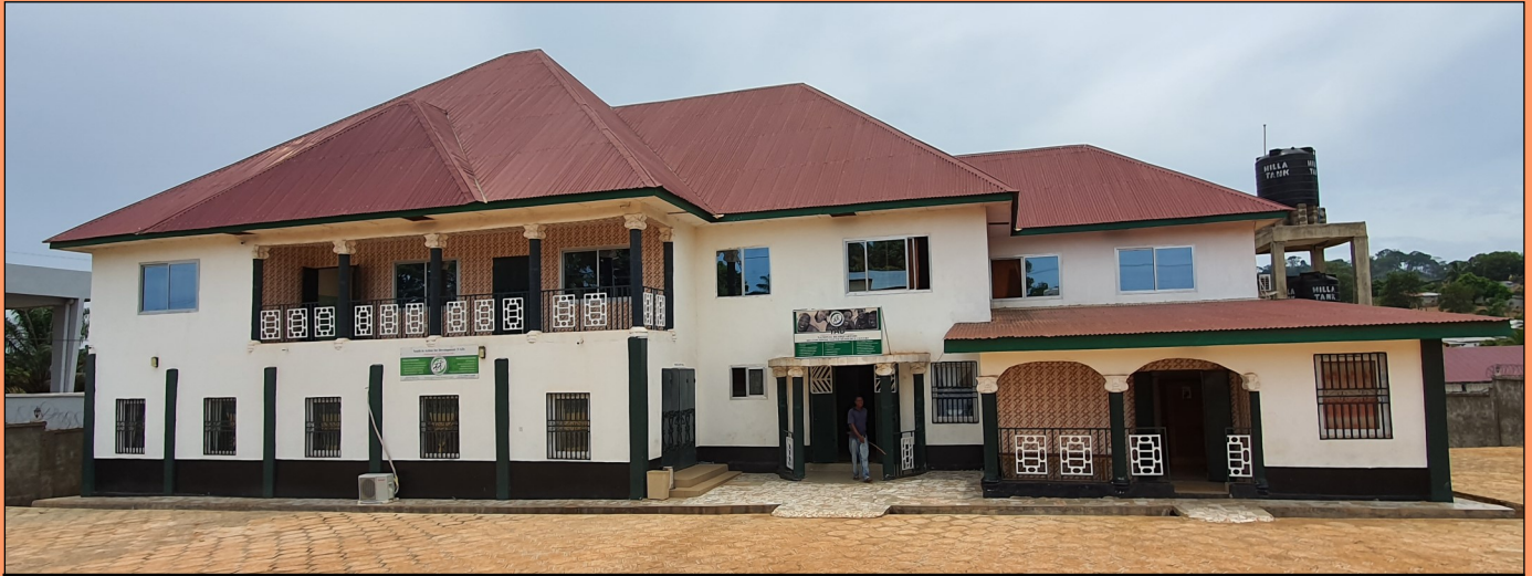
Front view of the Multipurpose Youth Resource Centre (MYRC) –Phase I which has eventually become YAD's national headquarters

The overarching objective of MYRC is to create a permanent home for YAD from where it can design and implement its development activities safely at cheaper cost, while fostering sociocultural cohesion and friendly coexistence among the youth across the region. Co-funded by YAD, Fambul Tik and the German Federal Ministry of Economic Cooperation and Development (BMZ), the project was primarily designed to be implemented in three phases. Phases I and II entails construction, furnishing and equipping the facility with all necessary gadgets. The two phases were designed to be implemented in three years. Phase III will be implemented forever! hence it is expected to provide the actual management structure and long term sustainability framework for phases I and II. While the latter is still in preparation for donor attention, the former have been successfully implemented as follows: