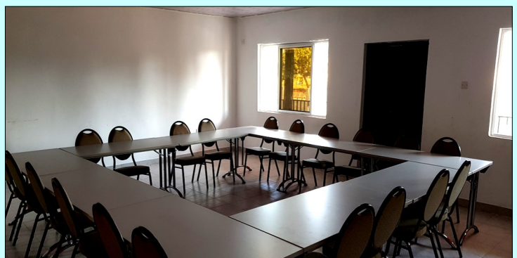
This room is also used as conflict mediation, reconciliation and resolution bureau

The conference room serves as our conflict and peace mediation centre where disputes are resolved among the youth without police involvement. Youths in domestic conflict situations are welcomed here to seek professional advice, mediation and peaceful settlement. This room is also used from time to time as an in-house capacity building training facility for YAD staff and affiliated youth organizations.