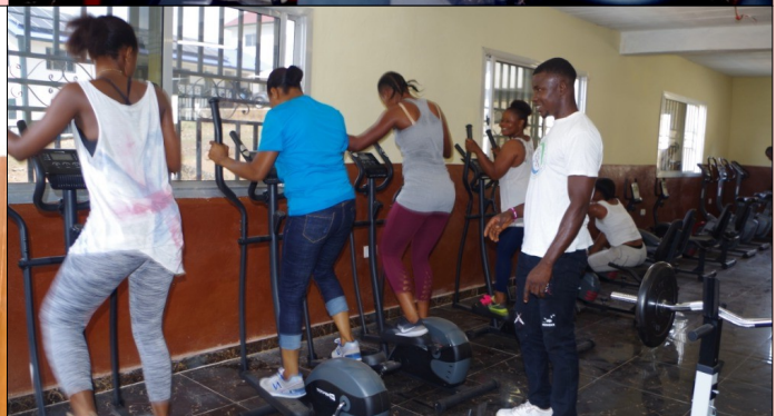
The fitness and recreational centre is second to none in Kenema city. The center offers physical, psychological and pedagogical therapy for every youth.