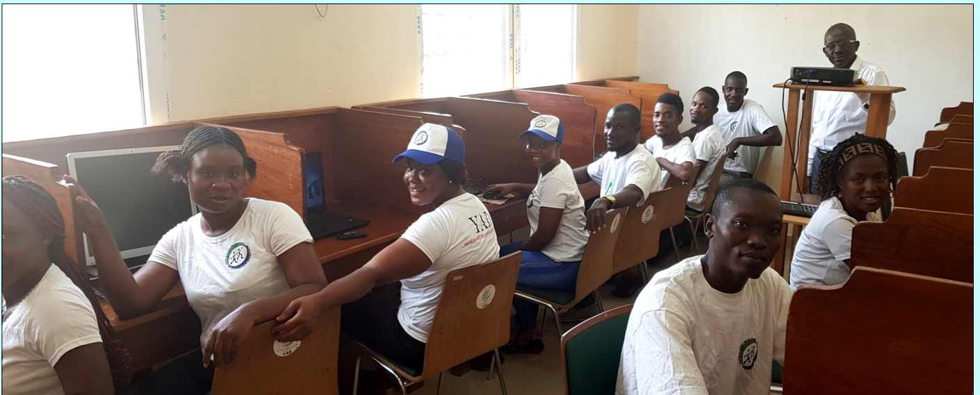
Our digital library is an advanced stand-alone server that contains more than 32 million documents, each fully indexed and searchable, using a built-in search engine

Our digital library is an advanced stand-alone server that contains more than 32 million documents, each of them fully indexed and searchable using a powerful, built-in search engine. YAD also has the option to modify the content by uploading our own information, pictures or videos using the built-in software. The digital library represents the collective efforts of hundreds of authors, publishers, programmers, librarians, instructors and students around the globe. The library contains more than 2000 renowned websites and it can be accessed offline without any internet connection.