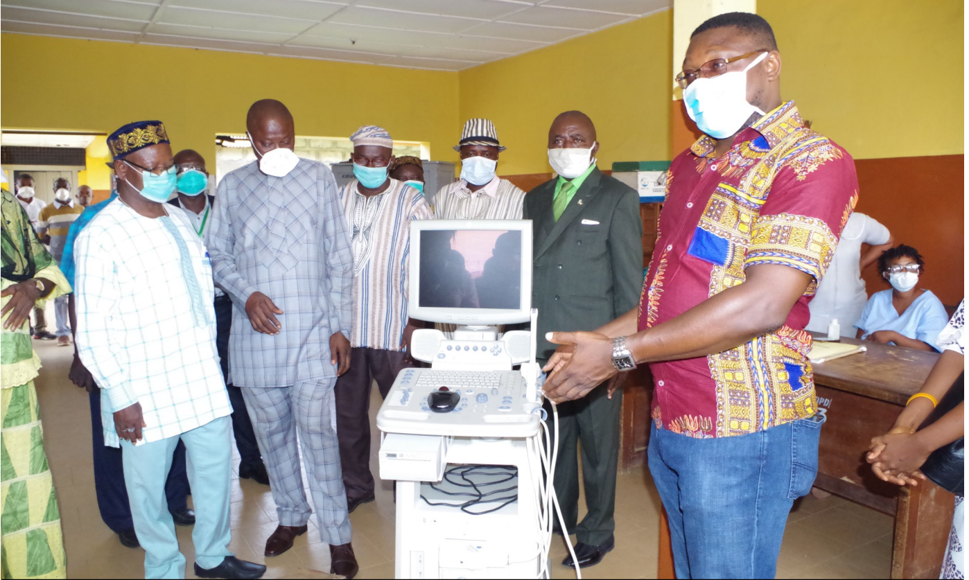
Stakeholders converged at Kenema Government Hospital to receive the YAD donated ultrasound machine

As a continuation of YAD's support to the health sector in Kenema district, The organization donated an ultrasound machine to the Kenema Government Hospital on 21 April 2020. The machine was a philanthropic gesture received from friends in Germany.