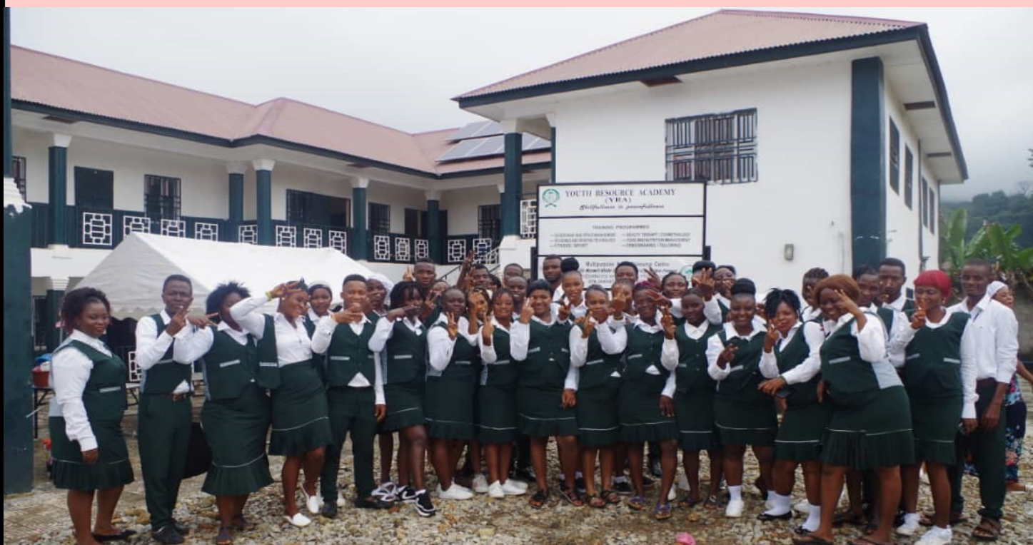
Front view of the Multipurpose Youth Resource Centre (MYRC) –Phase II which houses the Youth Resource Academy (YRA)