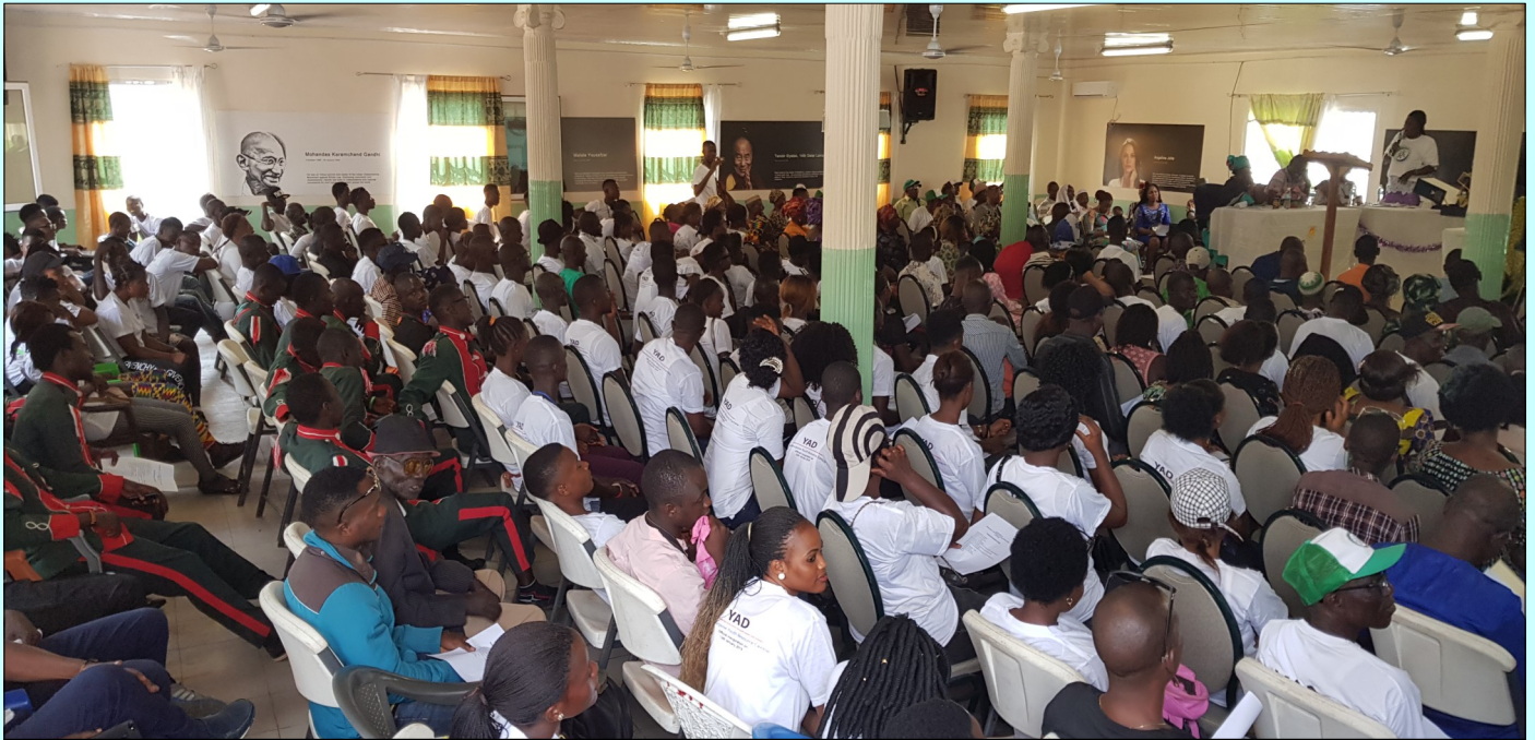
Our Peace and Unity Hall can accommodate up to 350 guest and its equipped with a modern PA system, large format projector, ceiling fans and AC

The hall complements our event management system. It is a multipurpose social mobilization facility that is well equipped with a robust musical system, sophisticated projector, air conditioners, ceiling fans, tables and chairs. This facility can conveniently accommodate up to 350 guest at a time. It is more ideal for development workshops, birthday parties, wedding receptions and institutional retreats. Added to the hall is our temporal kitchen which is equipped with refrigerators and all catering tools and utensils that can make a social event blissful.