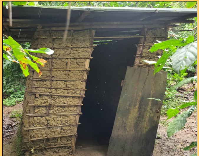
Pictorial view of some of the existing sanitary facilities in Niawa and Langurama chiefdoms. Most people prefer going to the nearby bushes or streams...