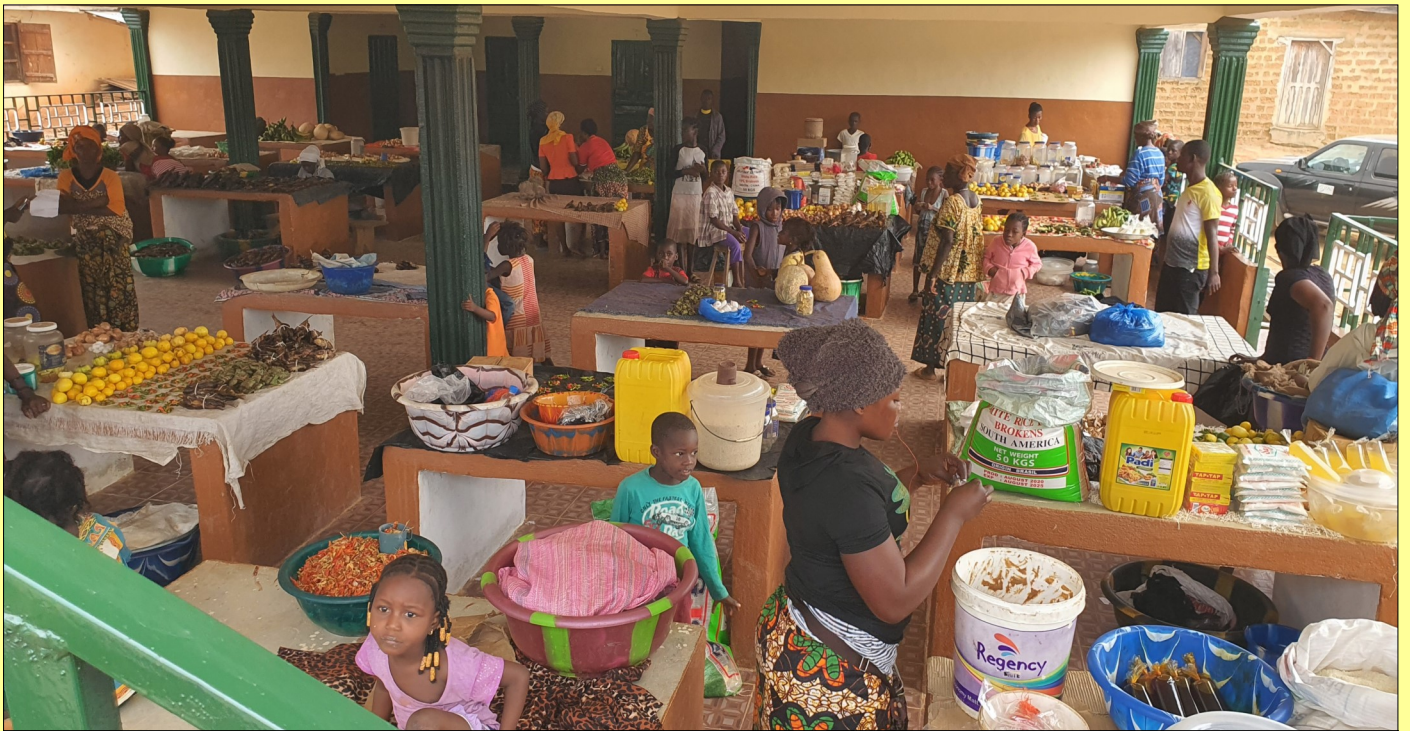
A current pictorial view of the Konjo Community Market and Social Mobilization Centre with the market situated downstairs and the social mobilization centre located upstairs.