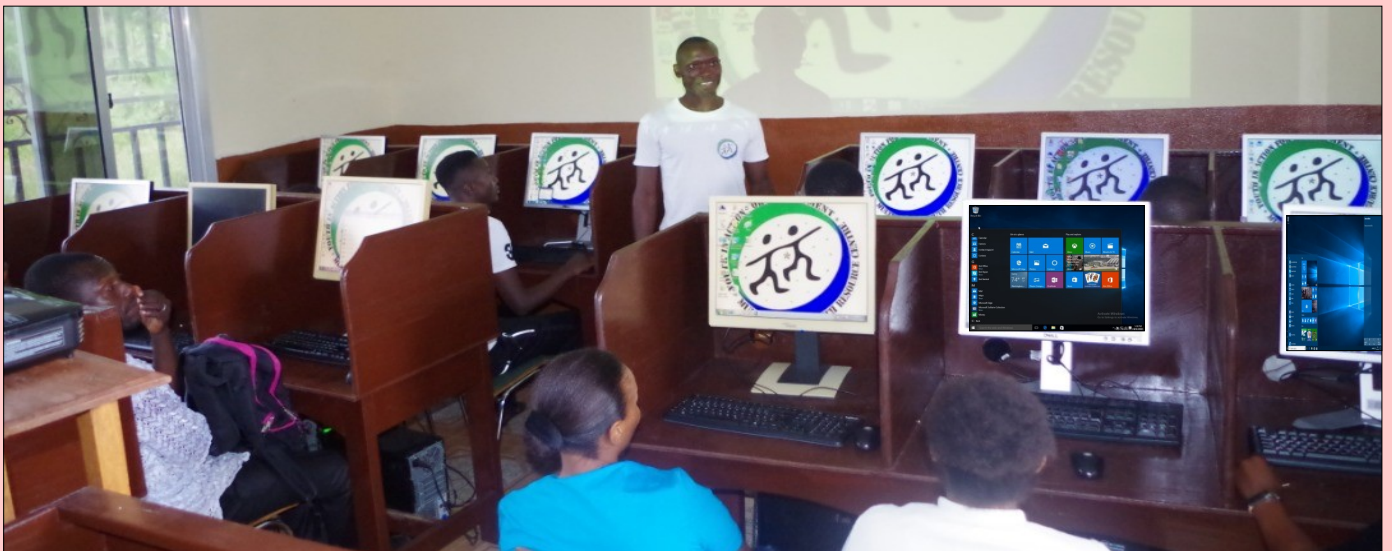
Our secretarial and office management department is fully equipped with 25 desktop/laptop computers which makes it possible for each student to gain permanent access to a computer throughout the studies. Student can even use a computer to take notes and accomplish period assignments – a facility that is not even offered by our universities.

This component will target youth who have had some degree of primary and secondary education but could not proceed to a tertiary level. The objective is to equip them with the necessary skills and qualifications to serve as secretaries or clerks in government offices, NGOs or other public institutions. The training will last for a period of 24 months and shall end with National Council for Technical Vocational and other Academic Awards (NCTVA) exams which shall grant the candidates a nationally recognized certificates in secretariat and office management studies. Added to the normal training syllabus, the candidates in this faculty have the opportunity to acquire an intensive training in information and communication technology (ICT) encompassing all the necessary Microsoft office packages. The objective is to help the candidates to develop confidence in themselves to undertake further tertiary studies while working in a Sierra Leonean office environment.